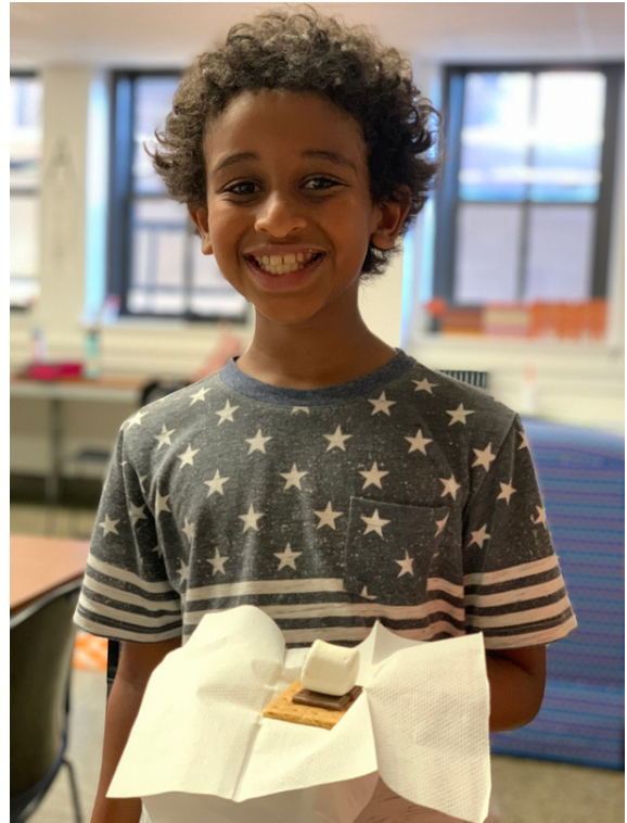
Science experiments at Shepherd Chemical