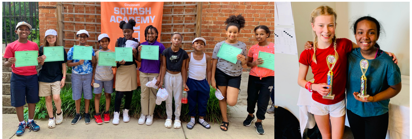
New student enrollment at EOY May party